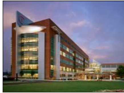
Kao Hsiung Veteran's General Hospital, Taiwan Jersey Shore University Medical Center, Neptune, NJ

Kosair Children's Hospital, Louisville, KY: senior medical planner and design architect for a new free-standing children's hospital while at FKP; followed by a major vertical addition a decade later at while at WHR in association with NBBJ.