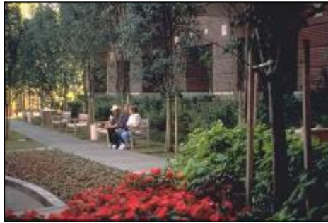
St. Michael Health Center, Texarkana, TX

DePelchin Children's Center, Houston, TX: master planner, senior medical planner, and senior designer for a locked residential psychiatric facility for adolescents. The challenge was to maximize the supportive character of the milieu and use of a wooded site while maintaining safety and security for troubled youth.