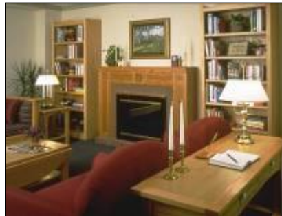
Planetree Unit, Trinity Medical Center, Moline, IL

University of Texas Medical Branch, Ambulatory Care Center, Galveston, TX: senior medical planner and design architect while at FKP for a major free-standing ambulatory clinic building connected to the John Sealy Hospital and adjacent to the historic Ashbel Smith building known as 'Old Red.' The project featured modular clinic designs that could be converted to different use as each specialty clinic needed to grow or shrink.