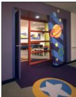
Yacktmann Children's Pavilion, Park Ridge, IL

Trinity Medical Center, Moline, IL: senior medical planner and design architect for a demonstration unit renovation to model the conversion to a Planetree patient and family-centered care model which featured non-institutional design, a family living room and kitchen, and open access to the nursing station. Multiple patient room prototypes were tested for application to a later planned replacement project.