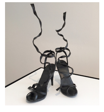
Brim, Elizabeth. Dancing Shoes. 2003. Forged and fabricated steel. 8 x 14 x 12 inches. Image courtesy of the artist. <sup>[1]</sup>