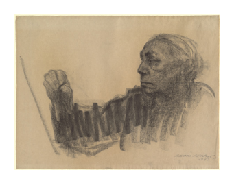
Kollwitz, Käthe. Self-Portrait, Drawing. 1933. Charcoal on brown laid Ingres paper. 18.75 x 25 inches. The National Gallery of Art (Washington, D.C.), Rosenwald Collection. [16]

Kathe Kollwitz is a master of contour drawing, but here a gesture line captures her intense need to make art, a line that escapes realism as if it is an x-ray of electric energy waiting for release. I feel this, and I wanted my students to find it too.