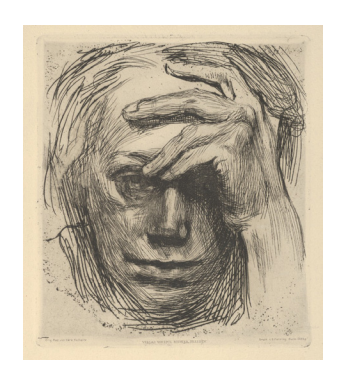
Kollwitz, Käthe. Self-Portrait with Hand on the Forehead. 1910. Etching and drypoint. 6 x 5.25 inches. The Metropolitan Museum of Art. [14]

I was dazzled by the work of Kathe Kollwitz when I first saw her prints at age eighteen. My first-year drawing class attended a Kathe Kolllwitz exhibition; I vividly recall exactly where I stood, awe-struck at "Death Comes for the Children". Her powerful, war-torn figures moved me profoundly. Her women had massive limbs and hands in poignant gestures of grief and suffering. Later, my own work became an exploration of human hand gestures which aspire to the raw beauty and strength I see in Kollwitz's figures. I am inspired by her art activism in producing posters championing the poverty-stricken, the working class, and victims of war. To me, Kollwitz is an artist unsurpassed in her heart-wrenching depictions of love, death and grief. In a male-dominated art world, she became a towering figure in German art. Her iron will and supreme talent propelled her art, despite suffering the horrors of two World Wars, having her art banned by the Nazis, and losing her son, grandson, and husband. Kollwitz still remains my role model. One of my standout art pilgrimages was to the Kollwitz Museum in Cologne, Germany, and I never tire of sharing her work with my drawing classes.