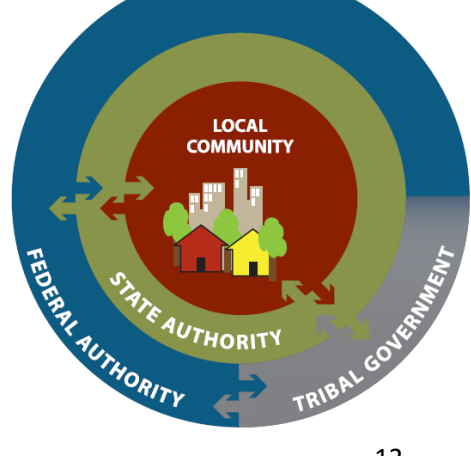
Figure 6: Recovery Participation Actor